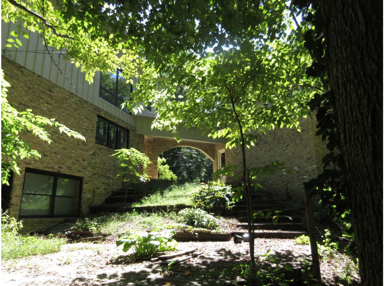
PHOTO 9: West Façade, Northwest Side of Breezeway, and Northeast Side of Garage, looking southeast