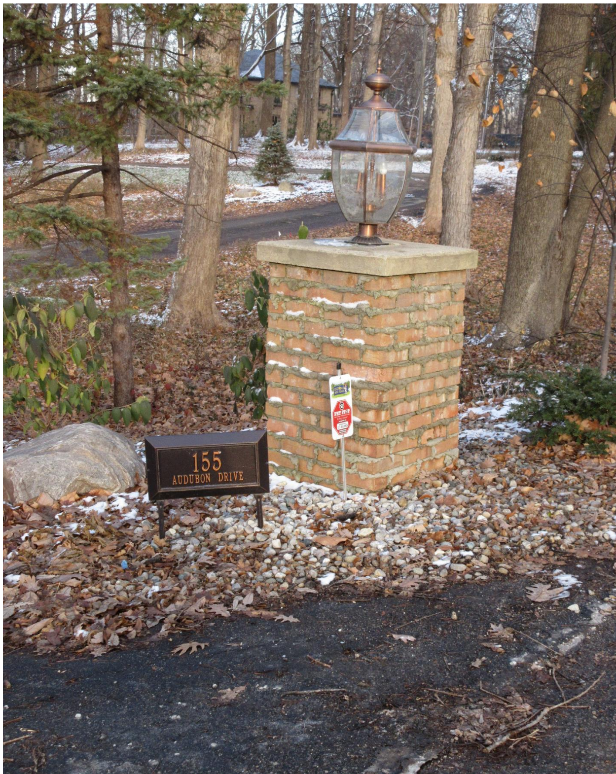
PHOTO 11: South End of Driveway, featuring original brick posts and lanterns