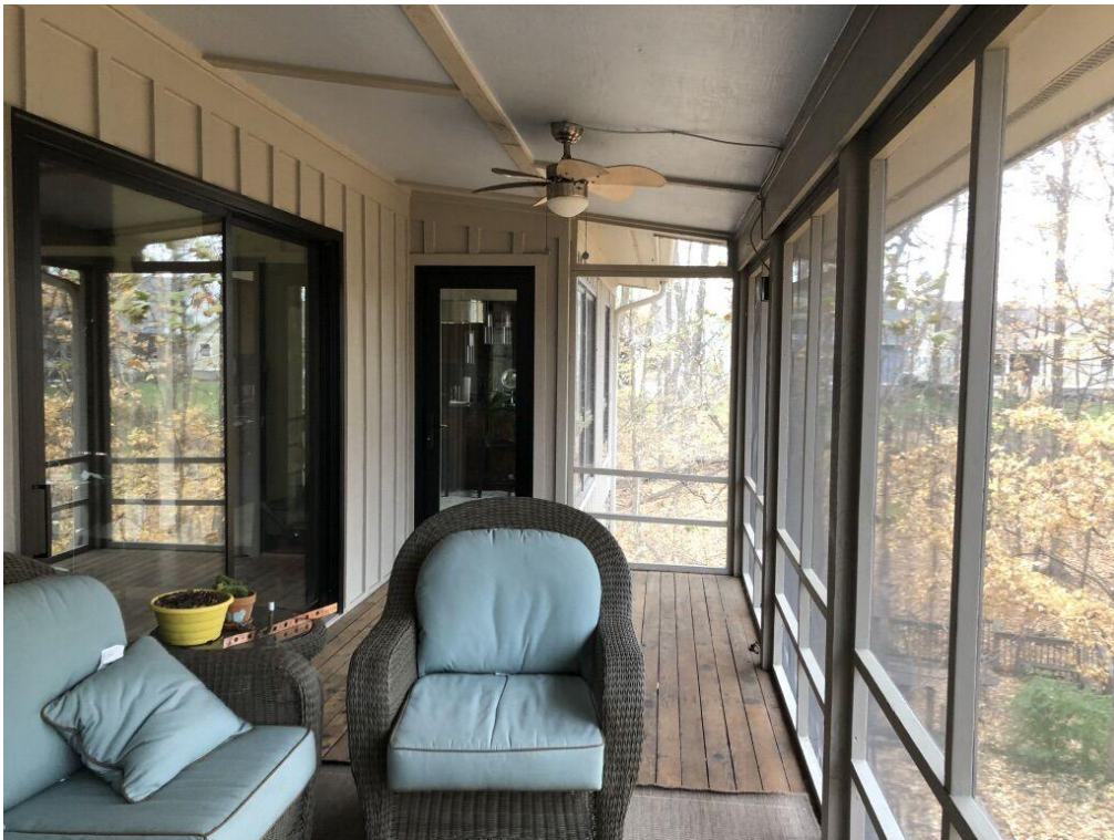
PHOTO 8: North Façade, second floor screen porch interior, looking west by southwest