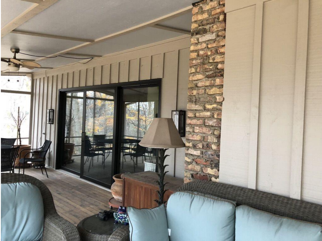
PHOTO 7: North Façade, second floor screen porch interior, looking southeast